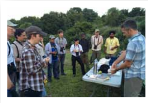
The class participants learning the safest way to extract and handle birds during the bird-banding exercise.

Each day began before sunrise with a mist-netting session, lessons on bird-banding best practice (bird ringing to those of us in South Africa), taking body size measurements and fitting tracking devices. Morning lectures covered topics such as basic migration ecology; life history evolution and physiology; bird breeding and moult strategies; tracking technologies; genetic techniques; isotope analysis and phenology. These jam-packed theoretical sessions were fortunately interspersed with outdoor practical sessions, to exercise our minds in a different way. The practical exercises taught point count and distance sampling methods, and using