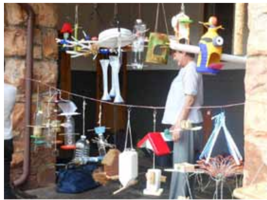
left Some of the bird feeders made by the Pre-Prep pupils at St John's College.

South Africa with a Call-finder® device as a prize for the Pre-Prep winner, and ZEISS South Africa made a pair of Zeiss Terra Binoculars available for the Prep winner.