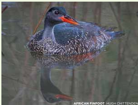
AFRICAN FINFOOT HUGH CHITTENDEN

KwaDabeka (KwaDabeka Bridge) for birders taking part in Birding Big Day