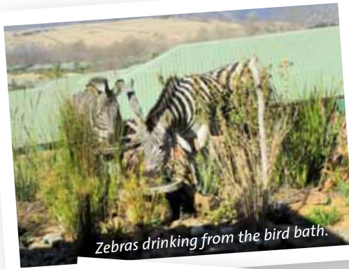
Zebras drinking from the bird bath.

Living on a nature reserve is great, one of the reasons we came to live here in Howick, but sometimes it is hard to love the creatures that roam among us. Right now I am finding my love for porcupines at quite a low ebb! My very precious Dierama bulbs made a delicious snack for them, just the bulb nibbled off, the leaves tossed carelessly to one side. Galtonia and Ornithogalum got the same treatment. I know porcupines particularly love Arums so I have not